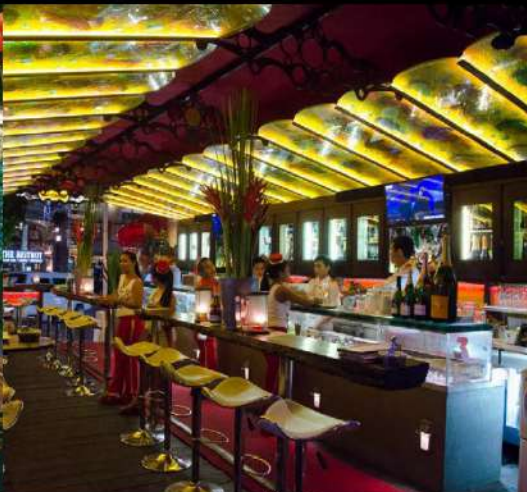
RED CARPET CHAMPAGNE BAR

A trendy nightclub with eclectic décor, cocktails, and late-night DJ sets.