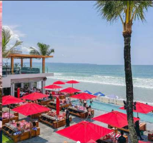
KU DE TA

Enjoy cocktails, international cuisine, and ocean views by the infinity pool.