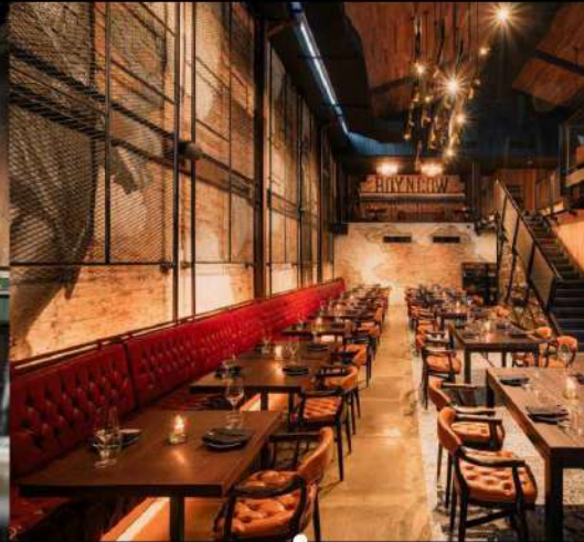
BOY N COW

Indulge in modern Asian cuisine with a vintage-inspired ambiance at Mama San.