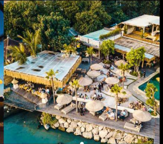
MANO BEACH HOUSE

Chic cocktails and ocean views at this lively W Bali hotspot.