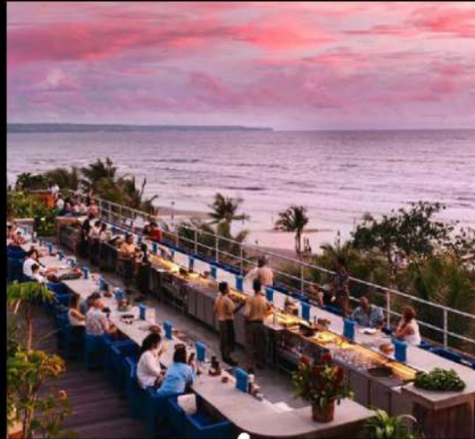
POTATO HEAD BEACH CLUB

Enjoy cocktails, international cuisine, and ocean views by the infinity pool.